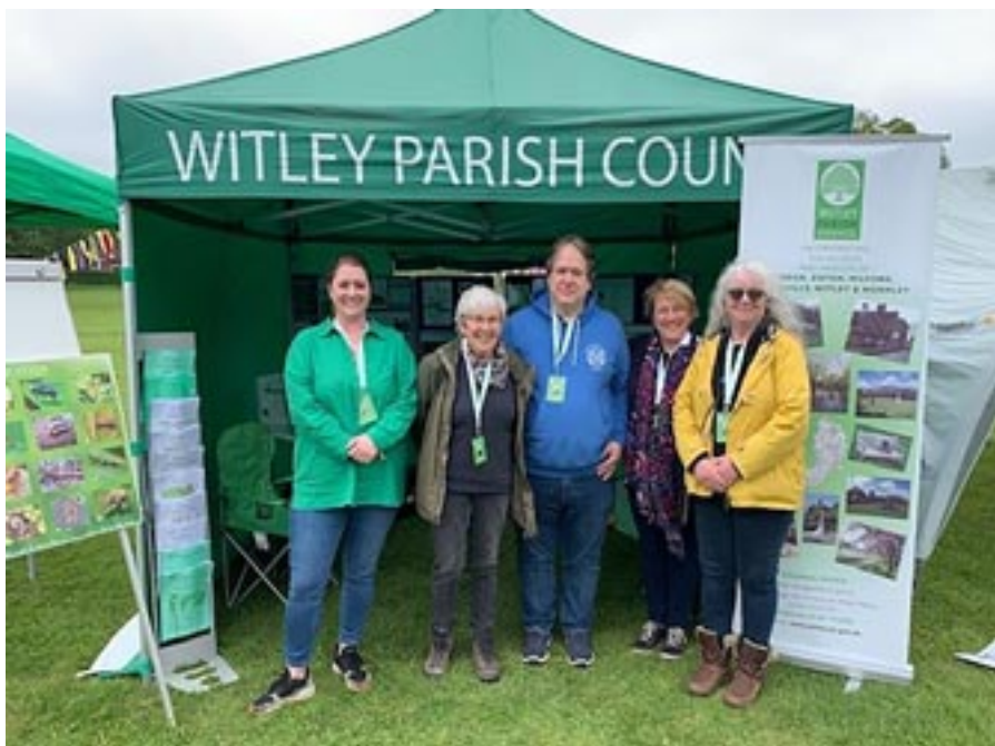
The Clerk and Councillors at WitStock in May

I have had the honour of being the Chair of Witley Parish Council for five years. It is now time for me to step down as Chair and hand over to someone who can bring fresh ideas and vitality to the role. At the Annual Meeting