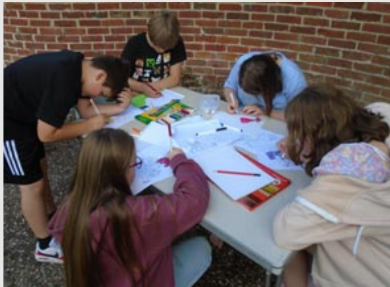
Example of Godalming Youth Service Activities